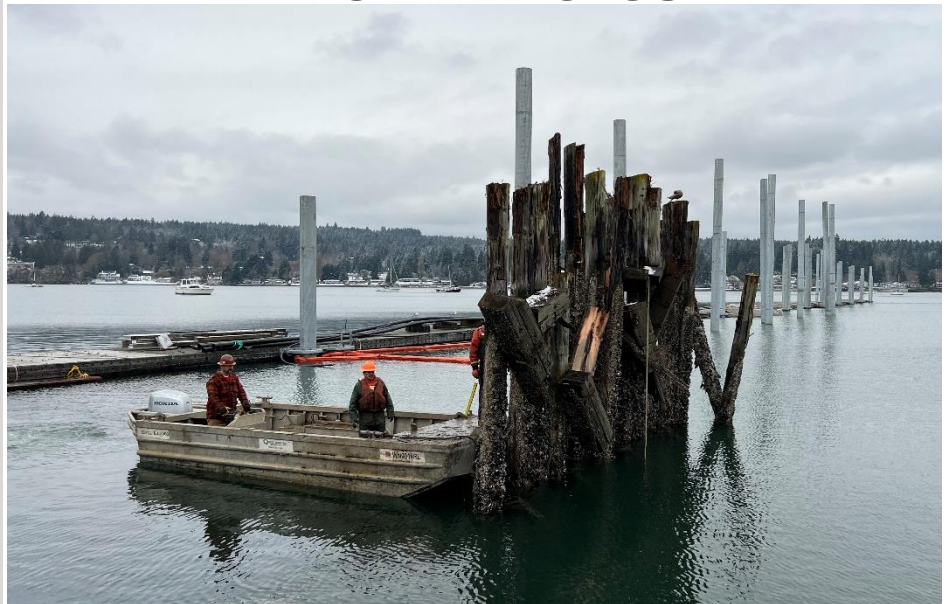
The old timber pile breakwater has now been fully removed!