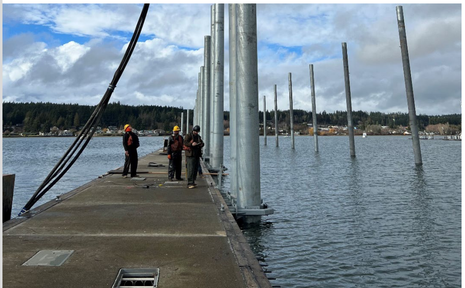
The new floating breakwater is now in place and all piles have been driven to secure it in its final position.