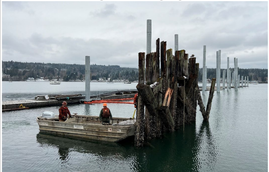
The old timber pile breakwater has now been fully removed!