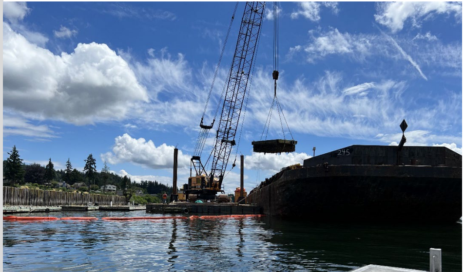
The existing breakwater floats are individually hoisted onto a work barge for complete refurbishment prior to in-water assembly of the new breakwater system