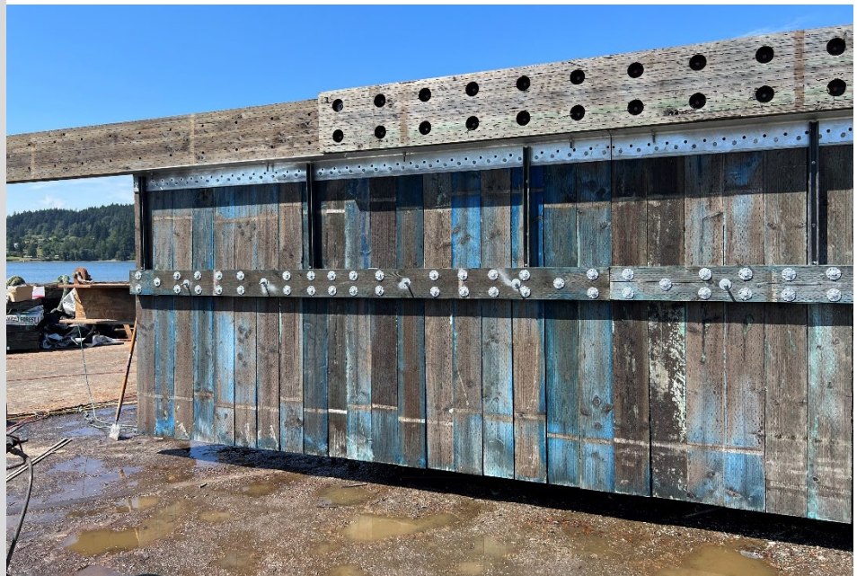
Refurbished floats are assembled in pairs with new timber walers and wave fence prior to placing them back in the water for final assembly